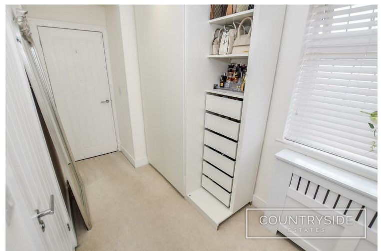
Bathroom 7'0" x 5'7" (2.13m x 1.70m)

Upvc window to side aspect with fitted shutters, smooth plastered ceiling, spotlights, tiled flooring and half tiled walls, vanity unit with mounted wash hand basin and chrome mixer tap, oval free standing bath with chrome mixer tap and handheld shower, dual flush close coupled W.C, chrome heated towel rail.